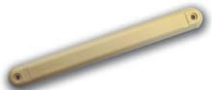
Confidex Survivor™ RFID tag