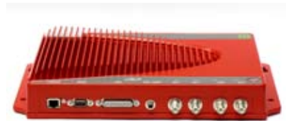
EB RFID Reader URP1000-ETSI