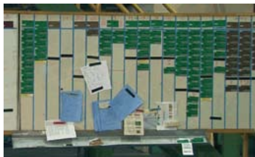
Manual control of production process

To optimize their manufacturing process and better control key assets, Nokian Tyres wanted to automate their Kanban process, and so evaluated different automated identification (ID) solutions and technologies. The combined expertise and products of Trackway ( www.trackway.eu ), EB ( www.elektrobit.com ) and Confidex ( www.confidex.fi ) was selected to meet Nokian Tyres' challenge.